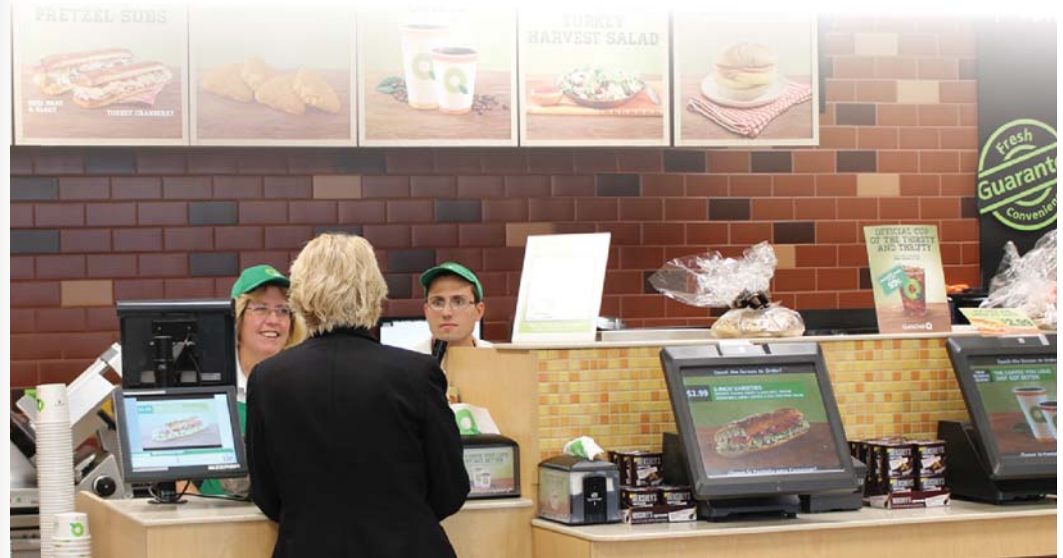
QuickChek Store - South Bound Brook, NJ

"We needed a process that was simple and easy to execute to deploy the content to over 600 kiosks in our stores."